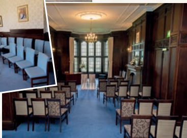
THOMAS ROBINSON BUILDING, Stourbridge