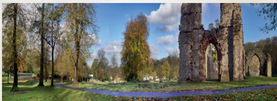
PRIORY HALL, Dudley